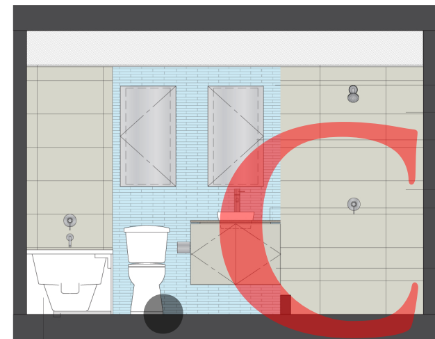
BATHROOM ELEVATION A