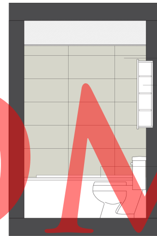
BATHROOM ELEVATION B