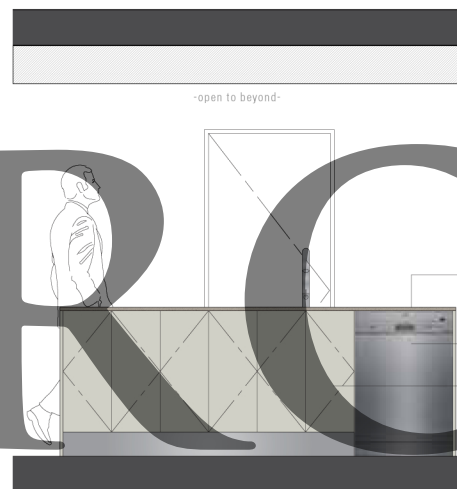
KITCHEN ELEVATION B